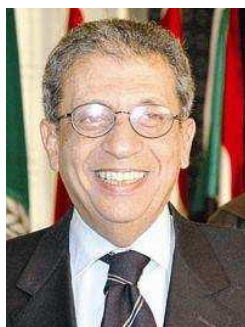
His Excellency Mr. Amr Mousa Secretary General of League of Arab States